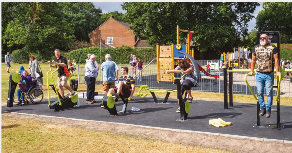
Assisting community sustainability - Norfolk's first outdoor eco-gym received a grant from the Sheringham Shoal Community Fund

Education is the main thrust of the Dudgeon Community Fund, which uses its £100,000 per annum donation from the Dudgeon Offshore Wind Farm to support STEM (Science, Technology, Engineering and Maths) initiatives which are designed to inspire the next generation of scientists, innovators and inventors from pupils in school years 8-13 in Norfolk.